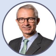
Ambassador Wouter Plomp